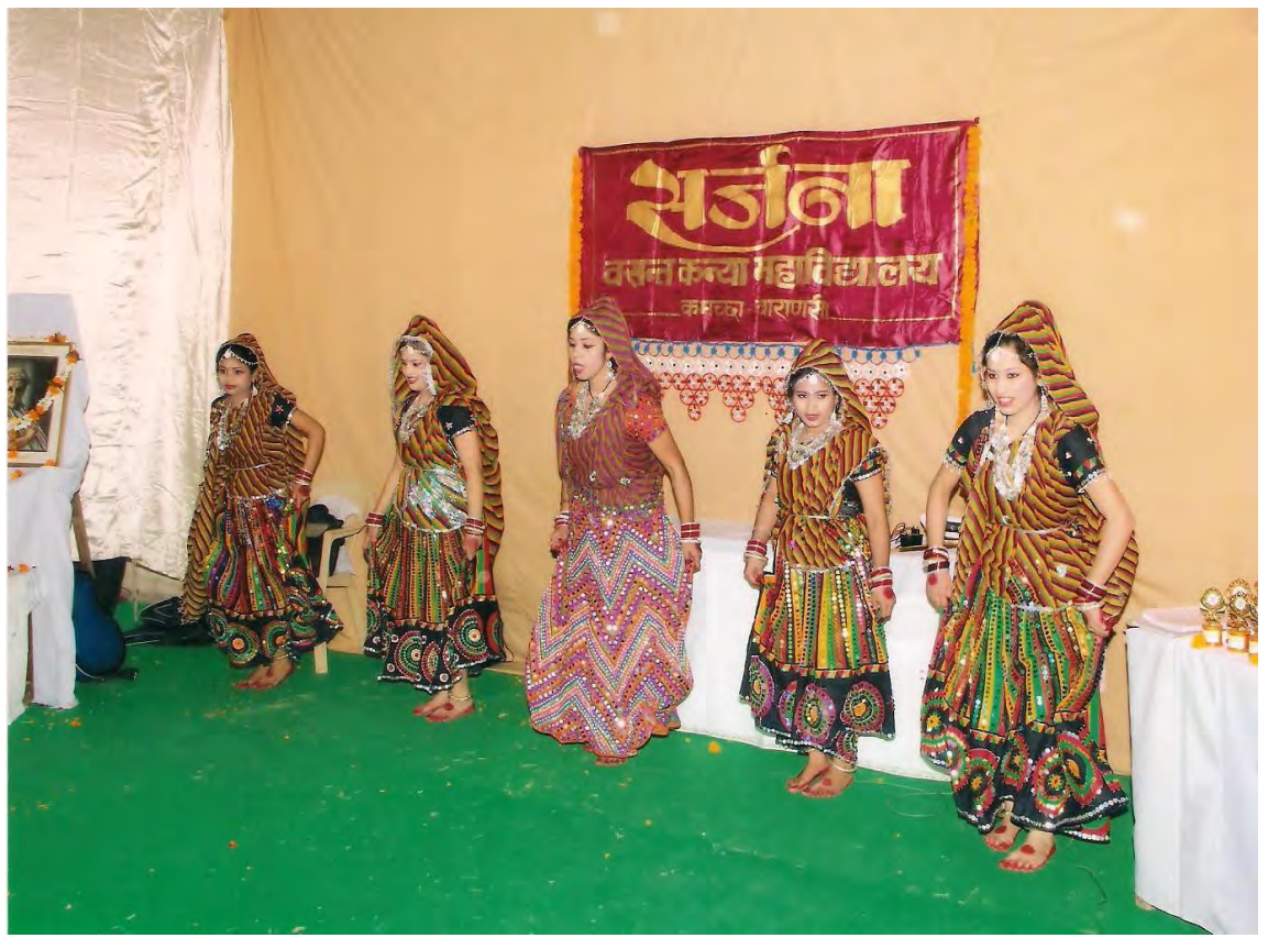
Students performing in Sarjana, 2011-12.