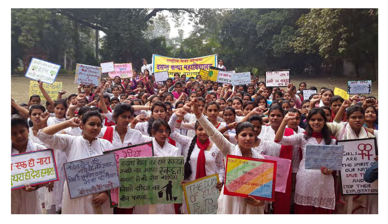
NSS Volunteers taking out a rally to create awareness regarding health and other social issues