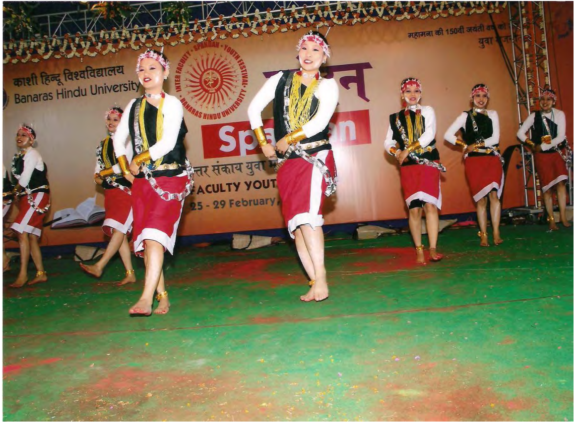
Students performing in Spandan, 2011-12. V.K.M. won I Prize in Folk Dance.